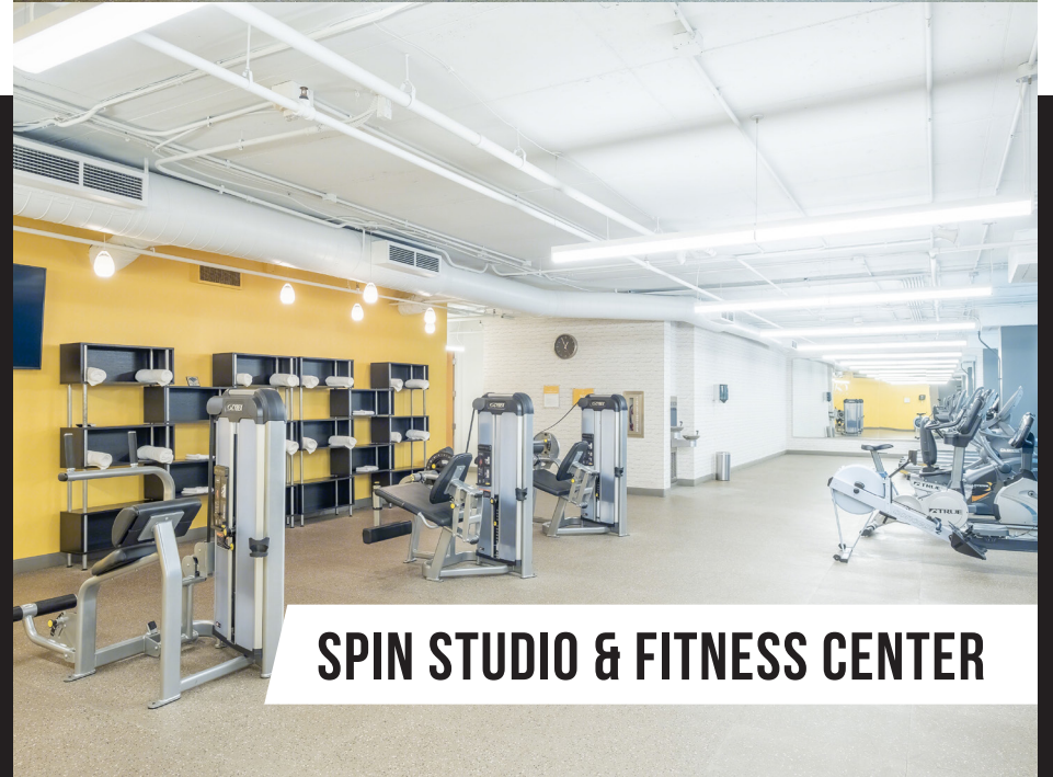
SPIN STUDIO & FITNESS CENTER